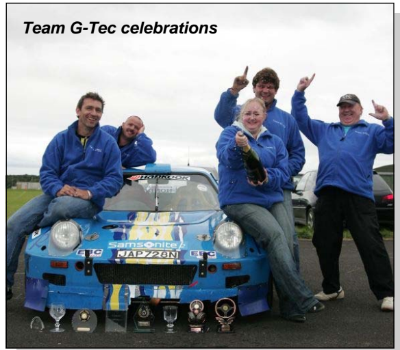
Team G-Tec celebrations

With a confirmed championship win in Class B and an overall title almost in our grasp, the bubbly was popped and duly sprayed everywhere. Sorry if anyone got caught in the fallout - Dad told me to do it!