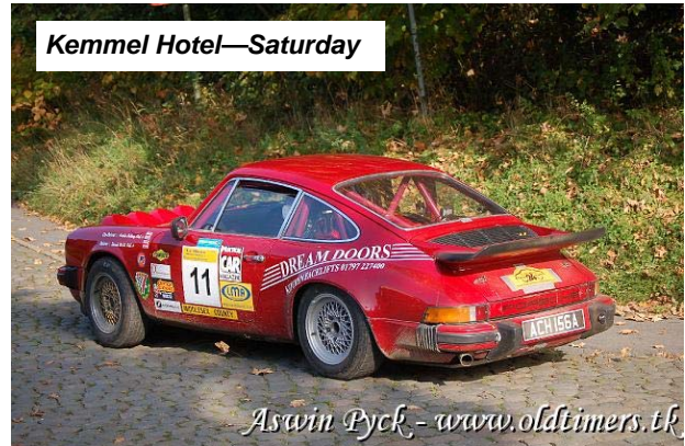
Aswin Pyck - www.olddtimers.tk

Leg 2 (102km) from Poperinge started very well using a mixture of Tulips, marked maps and fish bones. However the final 4 plots on the fish bone sent many crews, us included, on a merry dance round and round the same loop, disappearing up each others