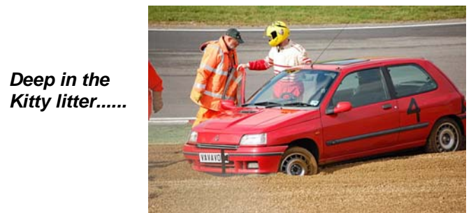
Deep in the Kitty litter.....