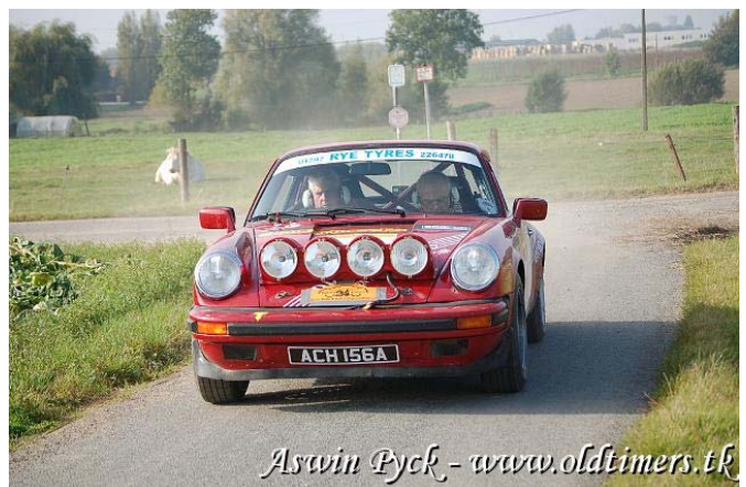
Aswin Pyck - www.olddtimers.tk

Before the final leg of the day we set of for a well earned buffet at the 'Passim' restaurant Bellewaerde on the outskirts of Ypres.