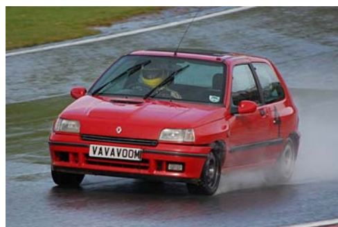
2nd timed lap was wet, wet, wet!!!